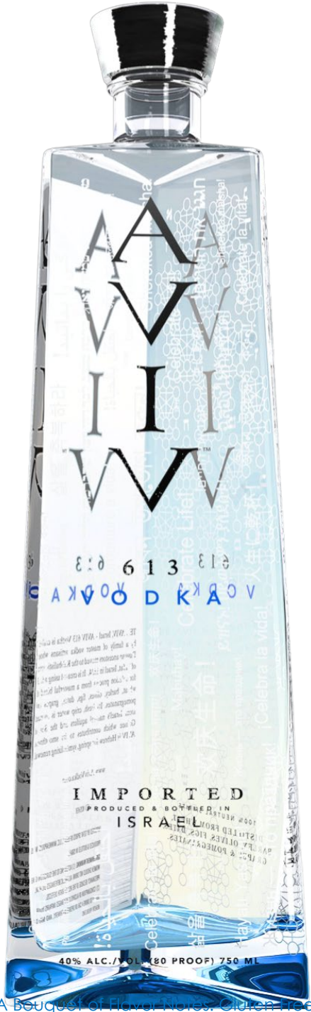
A Bouquet of Flavor Notes. Cullen Tree

AVIV 613 is the most crafted and costly spirit to produce. It is vodka, but with a taste profile that is a bouquet of flavor notes, very different from any other. AVIV 613 is distilled from seven ingredients, not one like other vodkas. While 6.1.3. has a spiritual meaning, 3.1.6. represents AVIV's formulation process. The process begins by sourcing wheat, barley, olives, figs, dates, grapes, and pomegranates grown in the Holy Land. Our master distiller runs three distillations of the strained, fermented mash made from barley and wheat, and three distillations of the strained, fermented mash made from olives, figs, dates, grapes, and pomegranates. The amount of each ingredient is part of our secret recipe that took three years to perfect. We blend the grain and fruit alcohol and distill it once more for a total of four distillations. Further incremental distillations would diminish the aroma and character which makes vodka delicious. AVIV is filtered six times before adding water to obtain a 40% alcohol/80 proof spirit. AVIV's water is sourced from the Sea of Galilee which is the lowest elevated natural fresh water source in the world. This contributes to AVIV's smoothness. The result is a