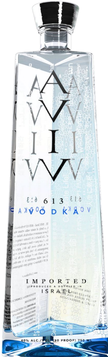
A Bouquet of Taste. Gluten Free

AVIV 613 is the most crafted and costly spirit to produce. It is vodka with a taste profile that is a bouquet, very different from any other. AVIV 613 is distilled from seven ingredients, not one like other vodkas. While 6.1.3. has a spiritual meaning, 3.1.6. represents AVIV's formulation process. The process begins by sourcing wheat, barley, olives, figs, dates, grapes, and pomegranates grown in the Holy Land. Our master distiller runs three distillations of the strained, fermented mash made from barley and wheat, and three distillations of the strained, fermented mash made from olives, figs, dates, grapes, and pomegranates. The amount of each ingredient is part of our secret recipe that took three years to perfect. We blend the grain and fruit alcohol and distill it once more for a total of four distillations. Further incremental distillations would diminish the aroma and character which makes vodka delicious. AVIV is filtered six times before adding water to obtain a 40% alcohol/80 proof spirit. AVIV's water is sourced from the Sea of Galilee which is the lowest elevated natural fresh water source in the world. This contributes to